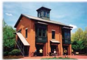
Xenia Station No matter which direction you point your bike, the riding is good in Greene County and beyond.

Xenia Station is located in Xenia on Miami Avenue between South Detroit Street (US 68) and Cincinnati Avenue (US 42) about three blocks south of the Greene County courthouse. Look for the B&O caboose. Restrooms are located in the replica of the original telegraph office. There is ample parking. This is the hub of all of the trails covered in this brochure. Unless otherwise indicated, all distances given are measured beginning at Xenia Station.